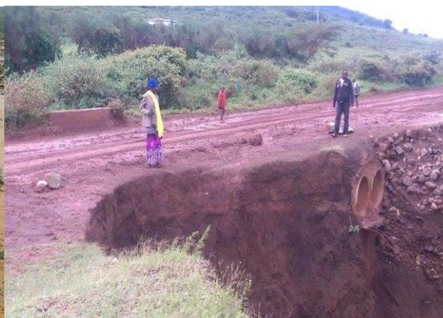
Part of a damaged road in Marsabit