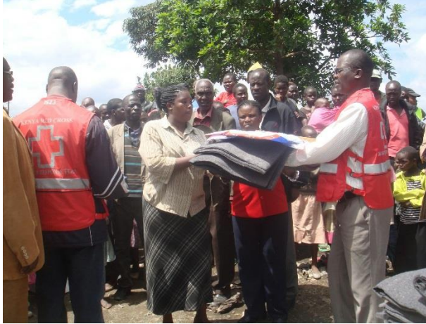
Relief distribution in Narok