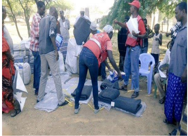
Distribution of relief items in Modogashe, Garissa County