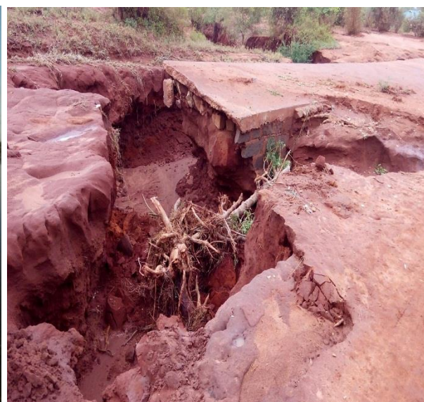
Damaged road in Maungu, Isiolo county