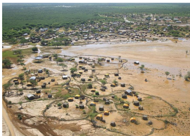
Aerial photo of parts of Garissa affected by floods

Photos of effects of El Nino rains and some of interventions implemented so far