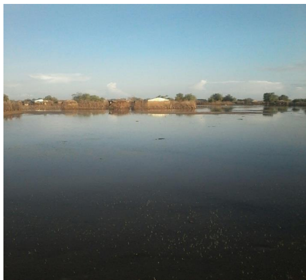
Flooded villages in isiolo county